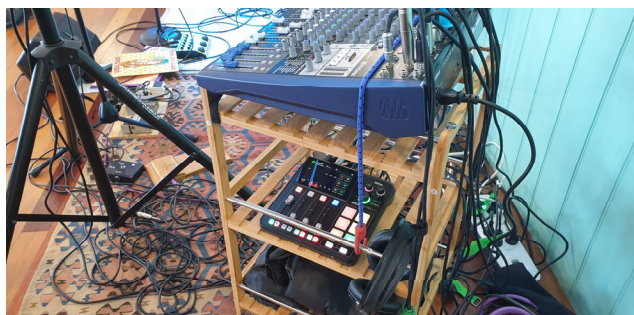
2NVR setup with one of our new digital mixers ready to record live music at an event at the Alofa Sands Surf Club (it's sitting underneath the professional muso mixer)

Available on the App Store (Apple) or Google Play (Android)