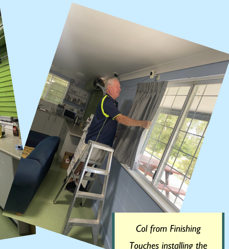
Col from Finishing Touches installing the new curtain.