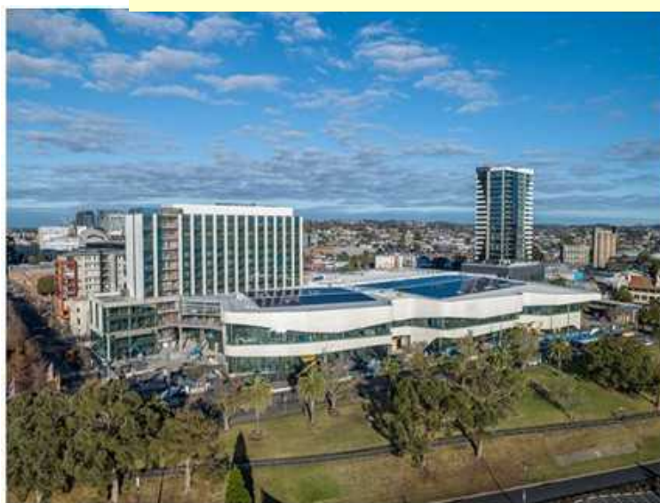
The functional and aesthetic 25,000-tile façade for Nyaal Banyul Geelong Convention and Event Centre is almost complete, ahead of the venue's expected opening in July 2026.